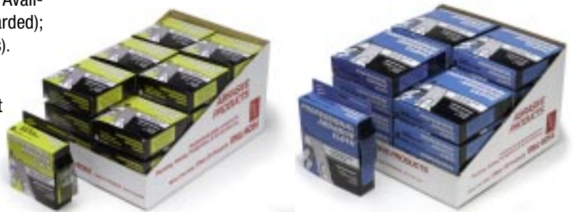
Clean Fit Abrasive Cloth Display/Shippers

Good, economy-grade closed coat abrasive cloth with "J" weight cotton backing. Water resistant. Available in three roll lengths 1-1/2" wide: #70175 (5 yards); #70170 (10 yards); and #70180 (25 yards).